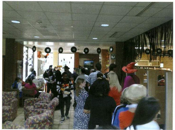
The Monster Mash at the Library Tower.

The Library also hosted a "Monster Mash" open house from noon to 1:30, where food and drinks were provided. Many departments decorated their offices and halls extravagantly and students dressed up as witches, ghosts, superheroes and villains alike. This is reflected in AUM annual Office Decorating Contest that involves staff and faculty alike. The Housing Office won "Best in Show" and "Best in Theme", followed by the Procurement and Payment Services and Nursing and Student Health Center Offices, respectfully. I can only hope that next year's Shriek Week will be even better than this year's.